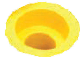
Recessed Holes for Mounting Hardware